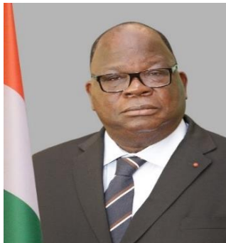
Mr. TCHAGBA Laurent Minister of Waters and Forests, Côte d'Ivoire